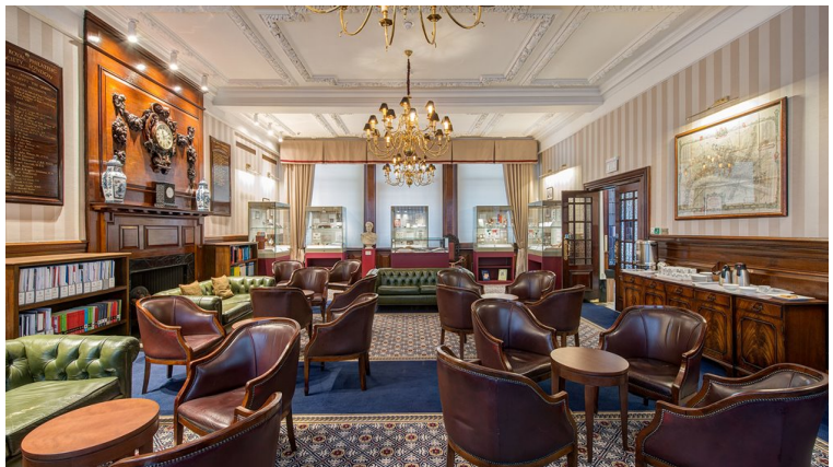
The Members' Lounge

“Remembering the Royal” book in which we will formally list bequests once received. We hope that the list of legacy donors will grow over the years. The book will be kept on prominent display and we will also acknowledge and honour legators on the RPSL website.